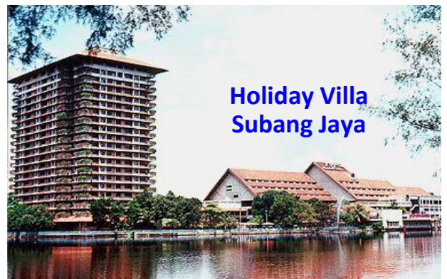
Holiday Villa Subang Jaya

Join us to learn and share what are the emerging trends and challenges of tomorrow projects, and get your self prepared today !